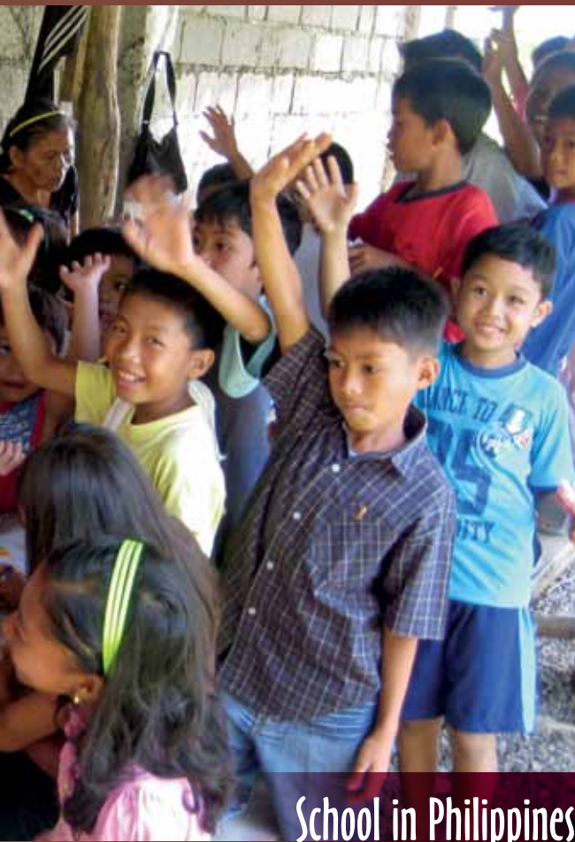
School in Philippines