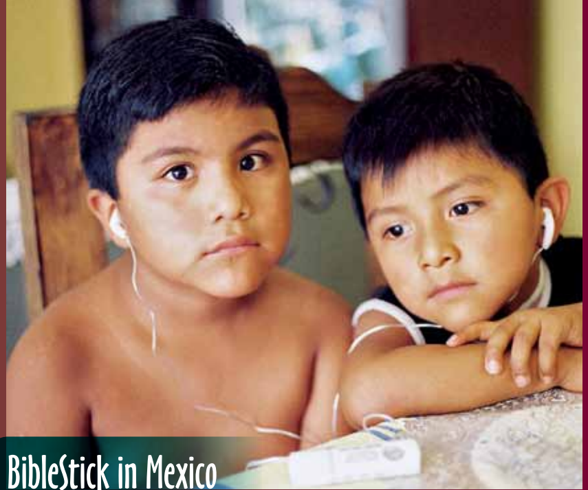
BibleStick in Mexico