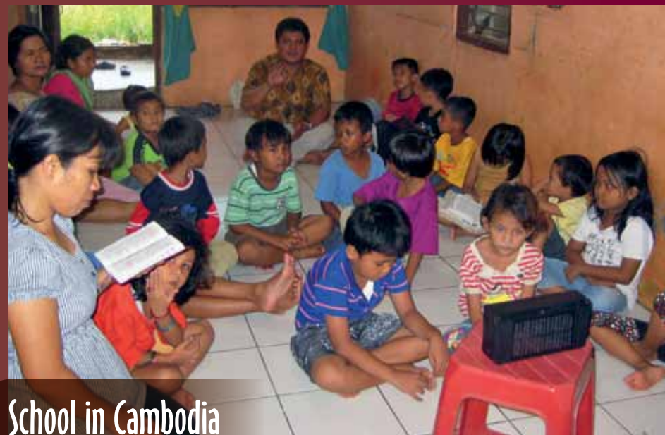
School in Cambodia