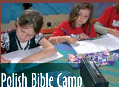
Polish Bible Camp