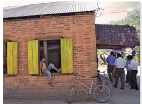
Parishioners enter a church in Paraguay.